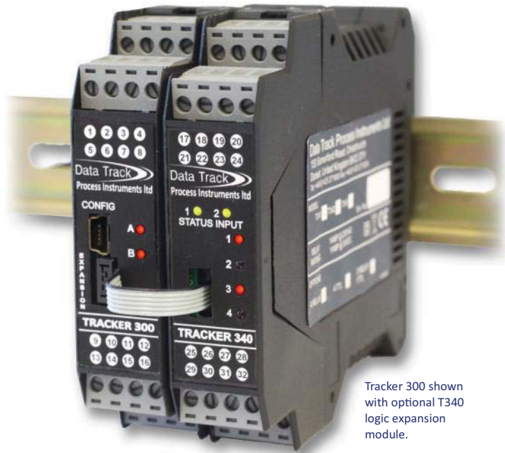
Tracker 300 shown with optional T340 logic expansion module.

For Signal Conditioning, Data Acquisition, PID Control and Alarms